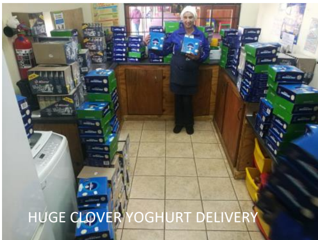
HUGE CLOVER YOGHURT DELIVERY

A big thank you to Clover who donated a large number of boxes for the children and their families