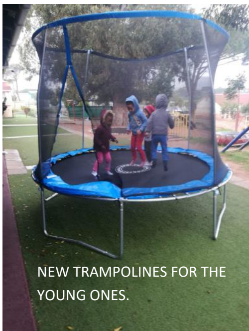
NEW TRAMPOLINES FOR THE YOUNG ONES.

The children from Somerset College spent their 60 Mandela Day minutes with the Gr.R class. Games were played