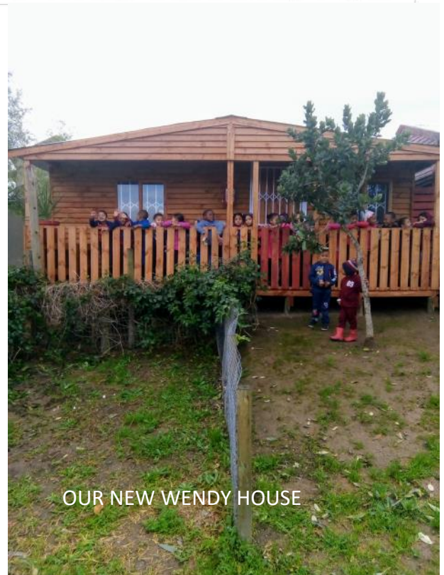
OUR NEW WENDY HOUSE

Hemel op Aarde project, Kagiso readers, Masikhule theme packs, Reading Eggs programme, the Learning Initiative and Somerset College Reading Club, amongst others, add spice to the learning life. We are looking forward to the next visit from the children of Somerset College reading club on 27/8/2019 and the parents on 10/9/2019.