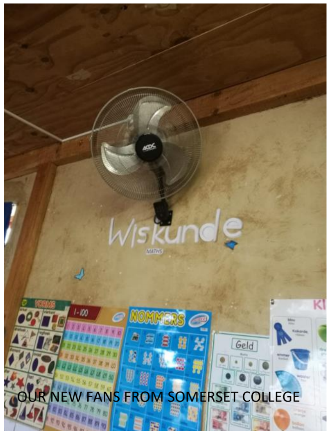
OUR NEW FANS FROM SOMERSET COLLEGE

The yellow class enjoyed the theme about vegetables a lot. The children named the different colours found in vegetables and used the colours for different other purposes. Vegetables were offered to see, touch and taste to stimulate their senses. Many children could not recognise or name the vegetables which gave me the opportunity to introduce it to them. The winter vegetables and their uses were highlighted.