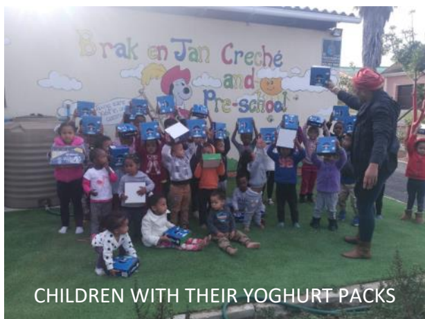
CHILDREN WITH THEIR YOGHURT PACKS