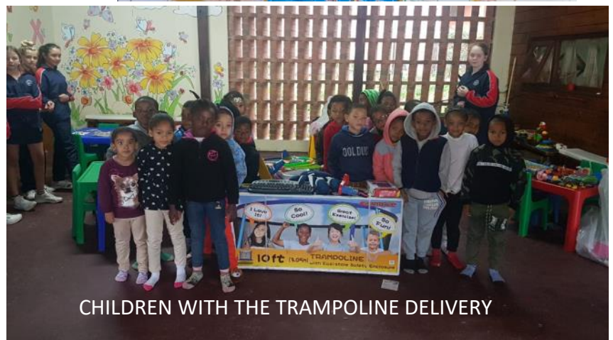
CHILDREN WITH THE TRAMPOLINE DELIVERY