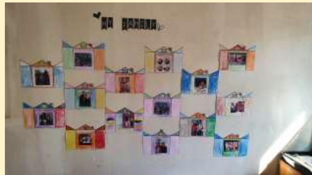
MY FAMILY ON A CLASSROOM WALL

We as teachers also want to make things easier for you at home and so together, we take our hands and work with you and your home routine to provide the best education for your toddler. We are not just a babysitting service, we work and play to