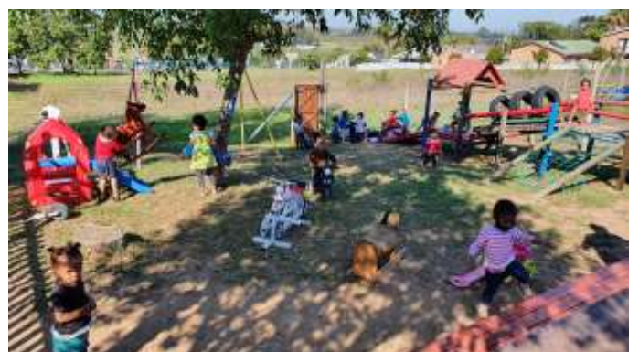
THE YEAR 1 AND 2 PLAYGROUND