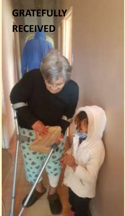
GIFTS FOR TEACHERS AT RAITHBY PRIMARY