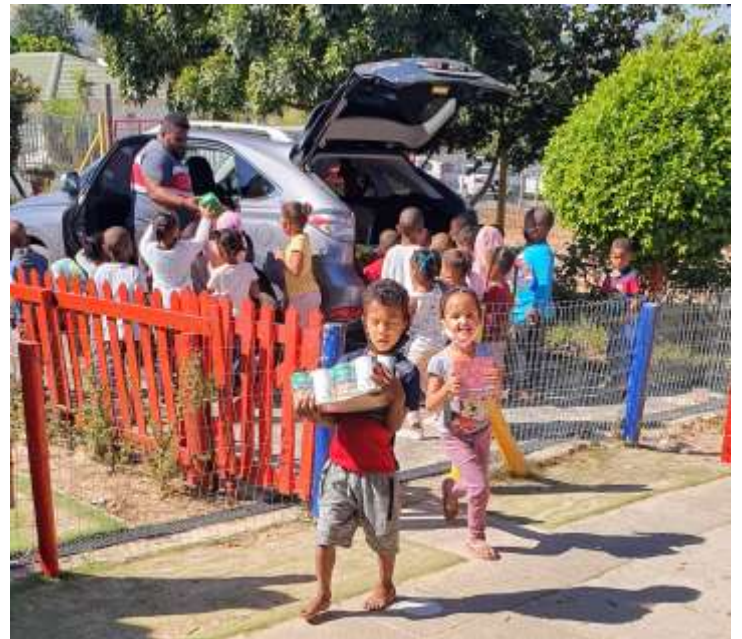
HELPING HANDS WITH FOOD DELIVERY