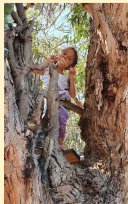
A HAPPY FACE IN THE TREE HOUSE

If you would like to remain on our mailing list, no further action is required. Your personal information is treated as confidential and you can opt out of our mailing list anytime. We will always include an unsubscribe link at the bottom of our emails.